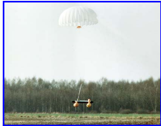
Parachute and Landing

The CL289 is the latest generation of unmanned, airborne surveillance systems. Capable of fast, deep penetration behind enemy lines, the CL289 acquires detailed, high-resolution intelligence and relays it in real time to core level commanders. Its onboard program commands the air vehicle to ascend, descend, and turn to accomplish the required mission profile. The drone carries both photographic and infrared line-scan sensors and can transmit real time imagery to a ground station.